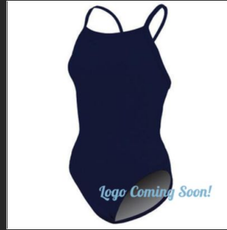
RSC Suit - Thin Strap