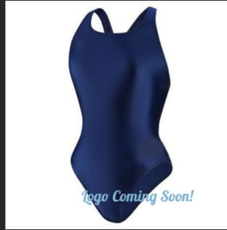
RSC Suit - Thick Strap