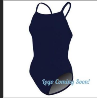
RSC Suit - Thin Strap