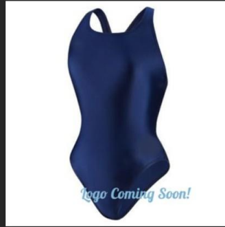
RSC Suit - Thick Strap